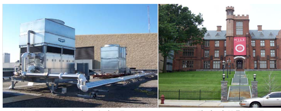
New Evaporative Cooler & Cooling Tower