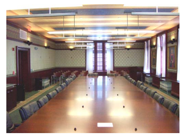
Heat Pumps on exterior wall

Originally designed by Architect John Welsh, Eberhardt Hall serves as the university's Alumni Center. It is a 35,000 sf four-story registered historic site due to its architecturally-significant structure. NJIT wished to totally renovate yet preserve the classical look of the structure. The scope of work required new architecturally-designed interiors, façade preservation, and new HVAC, plumbing, fire protection, and electrical systems to assure current code compliance and its continued use by and safety of its occupants.